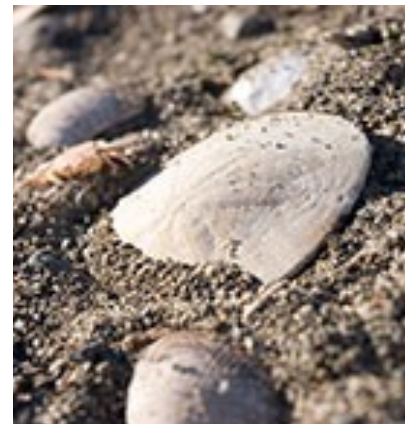
Sand Dollars can be common

For "Dunk in the Sound" see program schedule, based on tidal data for the day.