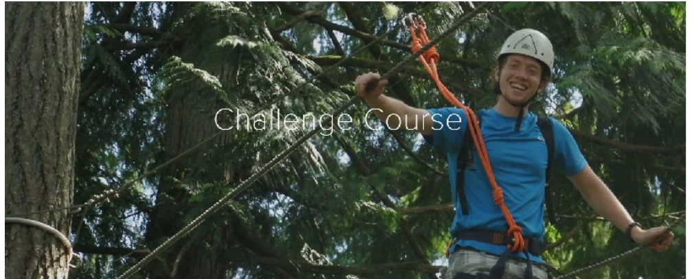
Picture of High Ropes Course