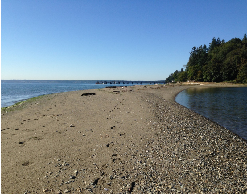
Sandbar at the beach at Sound View Camp